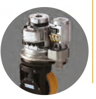
Crown's AC traction motor and cast iron gearbox are built to handle heavy loads. e-GEN braking harnesses motor torque to stop without friction brakes. and holds fast even on slopes All models offer optional electric power steering.