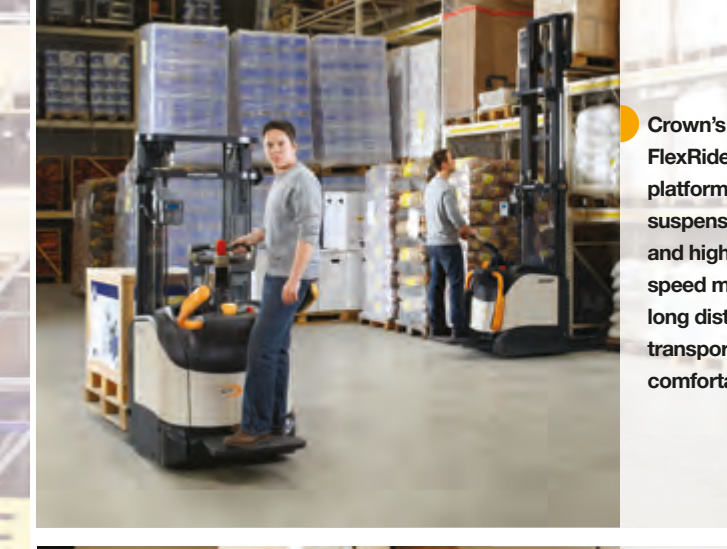
FlexRide platform suspension and high travel speed make long distance transport comfortable.

Crown's precision traction and lift control, as well as the outstanding visibility, excel in narrow-aisle retail applications.