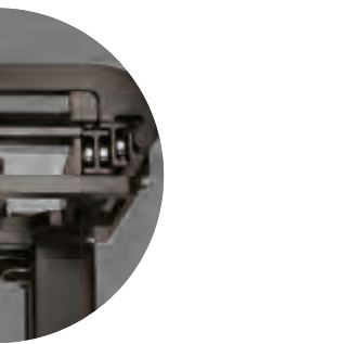
Nested I-beam rails and thick steel cross bars contribute to a rugged and stable mast with high residual capacities.