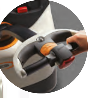
The control tiller's cast steel pivot joint, formed steel arm and die-cast aluminium handle stand up to severe abuse. Brake Override on the X10® Handle allows travel with a nearly vertical handle for up-close manoeuvring.