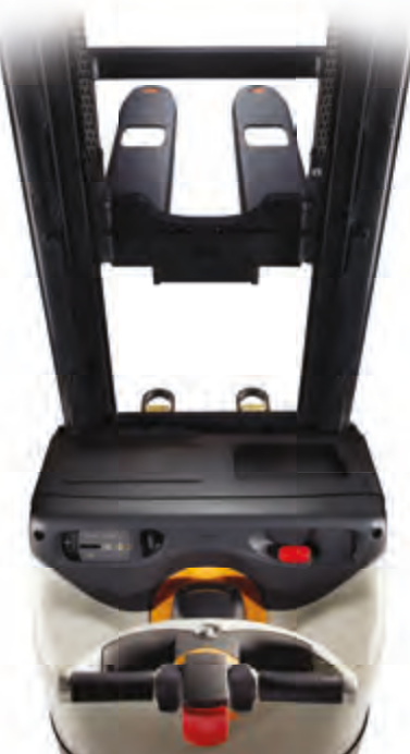
Superb all-around visibility results from a compact, contoured power unit and wide-open mast. The centre tiller gives operators balanced visibility to either side of the truck.