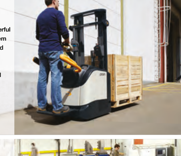
Confined areas are no problem with Crown's intuitive, smooth control for precise navigation and positioning.

Crown's powerful traction system and ramp hold feature allow long slopes to be handled with ease.