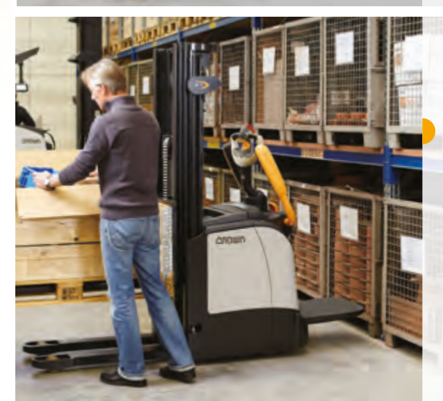
Crown's robust side restraints can be easily folded up and down for convenient entry and exit.